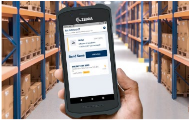
Figure 1: The Zebra TC21/TC26 handheld PC provides an overview of the current status of orders and warehouse load at any time.