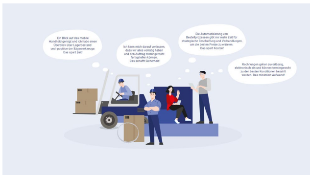
Figure 2: The WStockIT® ordering and warehouse management system covers the customer's entire purchase-to-order process, saving time and money across the board.