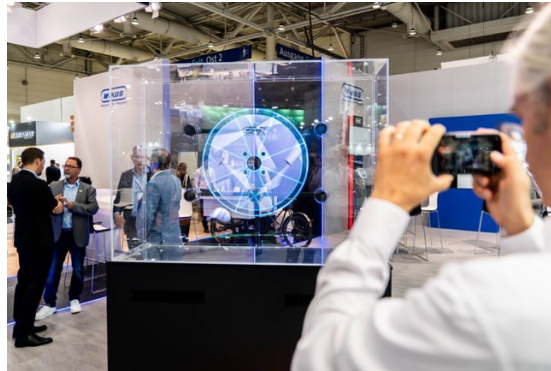
Figure 2: The KREOS® precision circular saw blade was in action digitally at EMO 2023 and attracted a lot of attention as a hologram.

Sustainable and forward-looking action by companies were also the key themes at EMO 2023 in Hanover. At the leading trade fair for metalworking, WIKUS presented its innovative sawing solutions, sustainable product highlights for purchasing and procurement, as well as environmentally friendly measures that are being implemented at the company headquarters in Spangenberg.