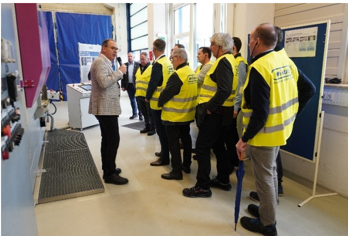
Figure X: Sawing demonstrations allowed participants to see the performance of WIKUS band saw blades for themselves 2025