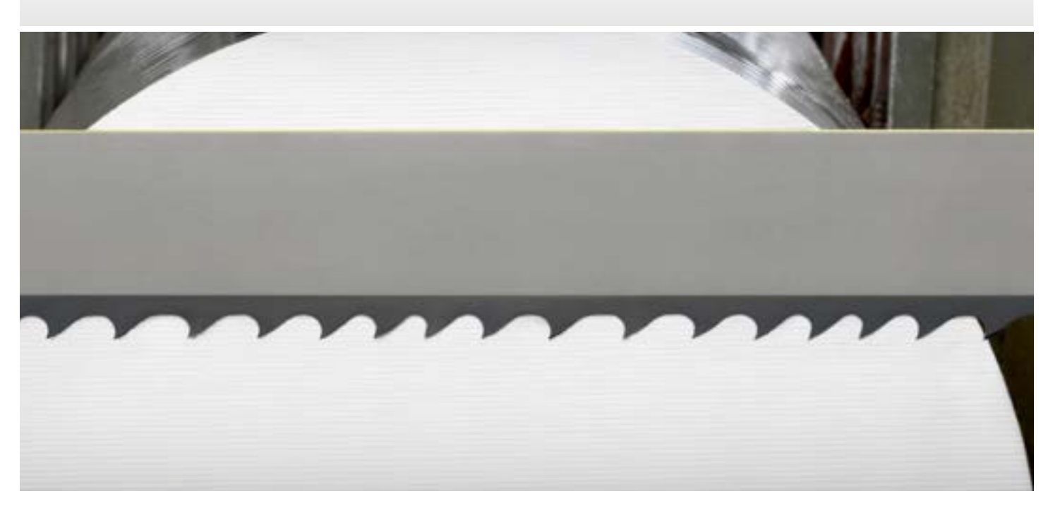
K = Hook tooth